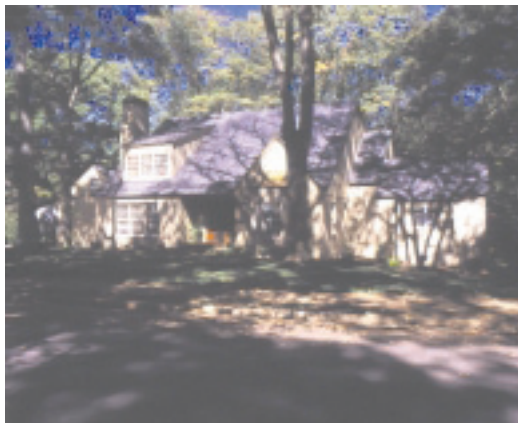
BUILDING HOMES... BUILDING RELATIONSHIPS